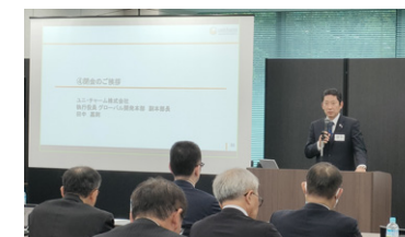
15th Unicharm Medium- to Long-Term Policy Briefing Session

In October 2024, we held the 15th Unicharm Medium- to Long-Term Policy Briefing Session for Suppliers with the aim of stabilizing material quality and disseminating our procurement policies and guidelines. The 2024 event, which was also streamed online, was attended by 283 participants from 133 companies, including material suppliers for personal care products, as well as material suppliers for pet care products and external production contractors. The aim of this briefing session was to enhance awareness of our various policies, including the Unicharm Group Basic Environmental Policy, the Unicharm Group Policy on Human Rights, and the Basic Policy of Procurement, as well as to request supplier cooperation by reporting, explaining, and ensuring understanding of our policies and guidelines for building a sustainable supply chain and using Sedex, progress in our various activities aimed at achieving Kyo-sei Life Vision 2030 and Environmental Targets 2030, data provision for the GHG Emissions Visualization Project, and quality control and other efforts aimed at improving customer satisfaction through the supply of safe products.