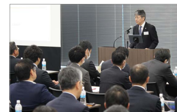
Medium- to Long-Term Policy Briefing Session

In October 2023, we held the 14th Unicharm Medium- to Long-Term Policy Briefing Session for suppliers to ensure consistent quality of materials and instill awareness of our procurement policy and guidelines. A total of 371 representatives from 143 companies, including material suppliers and contract manufacturers of personal care and pet care products, attended the session in person and online. Among the items covered were an introduction to our 12th Medium-Term Management Plan and an explanation on the division and transfer of production and logistics functions of the Pet Care Business. We also requested the understanding of suppliers on our policy and guidelines for establishing a sustainable supply chain, in addition to their cooperation on the use of the Sedex platform, in providing data for the GHG Emissions Visualization Project with a view to achieving Kyo-sei Life Vision 2030 and Environmental Targets 2030, and in quality control activities aimed at improving customer satisfaction through the supply of safe and reliable products.