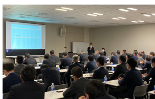
Medium- to long-term policy briefing session

Unicharm had been holding regular quality policy briefing sessions with suppliers since 2002 with the aim of ensuring consistent quality of materials and raise awareness of its procurement policies and guidelines. These briefing sessions were put on hold from 2020 due to the COVID-19 pandemic but reconvened with the medium- to long-term policy briefing session in October 2022, which shared with suppliers the direction Unicharm aims to take going forward. Attended by 234 people from 69 companies, including online participants, the briefing session raised awareness of the Basic Policy of Procurement, the Unicharm Group Sustainable Procurement Guidelines, and the Unicharm Group Policy on Human Rights, which declare our stance on human rights, labor, and environmental issues relating to procurement and on ensuring consistent quality. Through this briefing, we also asked for greater cooperation from suppliers on the GHG Emissions Visualization Project and Sedex as we proceed along the path to achieving Kyo-sei Life Vision 2030 and Environmental Targets 2030.